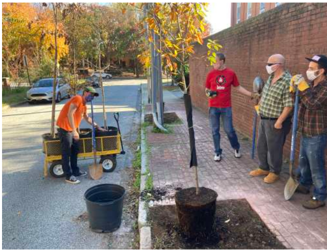
2020 tree planting.

Volunteering your time is a great way to get to know your neighbors and make a difference for an issue you care about in our community! Members can join existing committees or start new initiatives with board approval. For interest in Safety; Events and Engagement; Communication, Information and Historical Archives; Housing and CHAP; Park and Greening; Parking and Traffic calming, or to inquire about new opportunities, email president@setonhill.org .